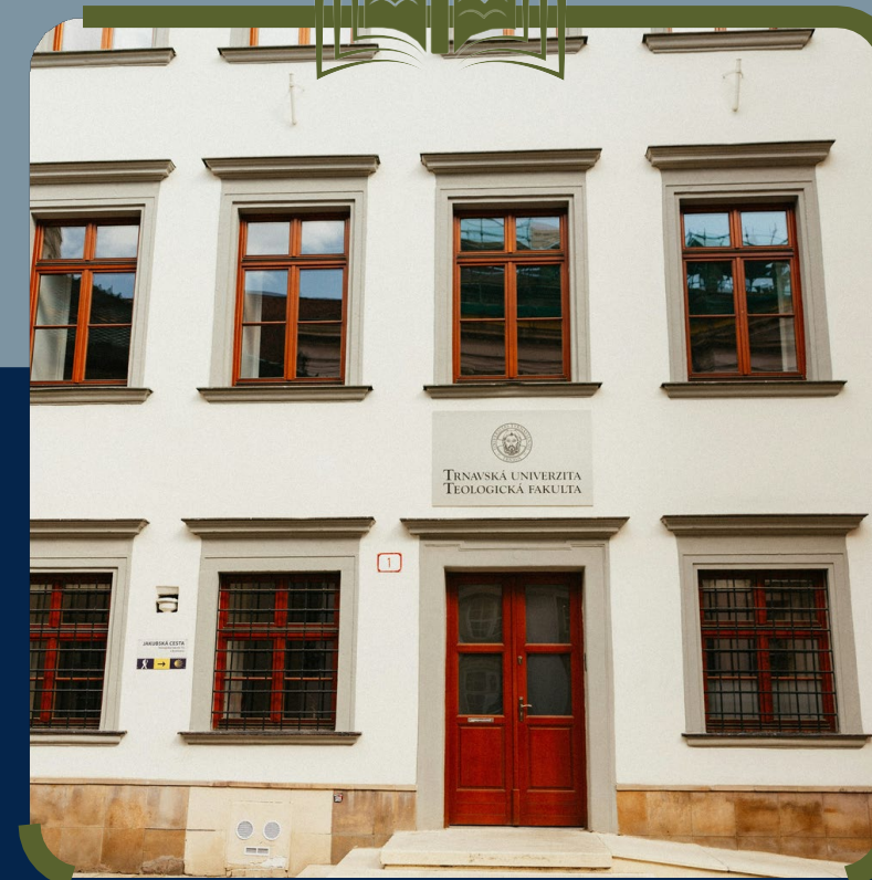
Faculty of Theology (Bratislava)